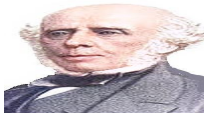
Figure-1: William Mackenzie (April 1791-July 1868), a Scottish physician

has reabsorbed. William Mackenzie (Figure-1) was most probably the first to provide a detailed account of the condition which included a description of a blighted ovum dissection [1, 2]. Since the 1970s, blighted ovum syndrome has been increasingly recognized as a cause of recurrent miscarriages [3]. The aim of this paper is to provide and educational ultrasound image and an educational review.